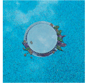
Typical pool drain with debris unable to exit pool