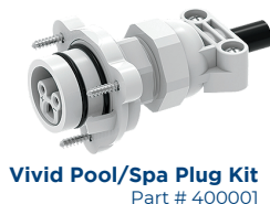
Vivid Pool/Spa Plug Kit Part # 400001