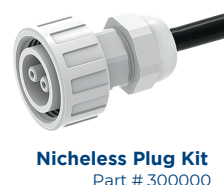
Nicheless Plug Kit Part # 300000