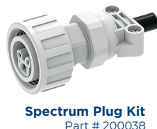
Spectrum Plug Kit Part # 200038